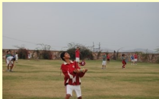
KITE FLYING 15 February