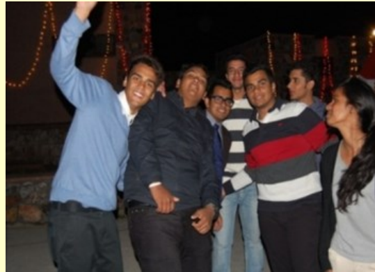
RUBY HOUSE (COCK HOUSE 2011-12)